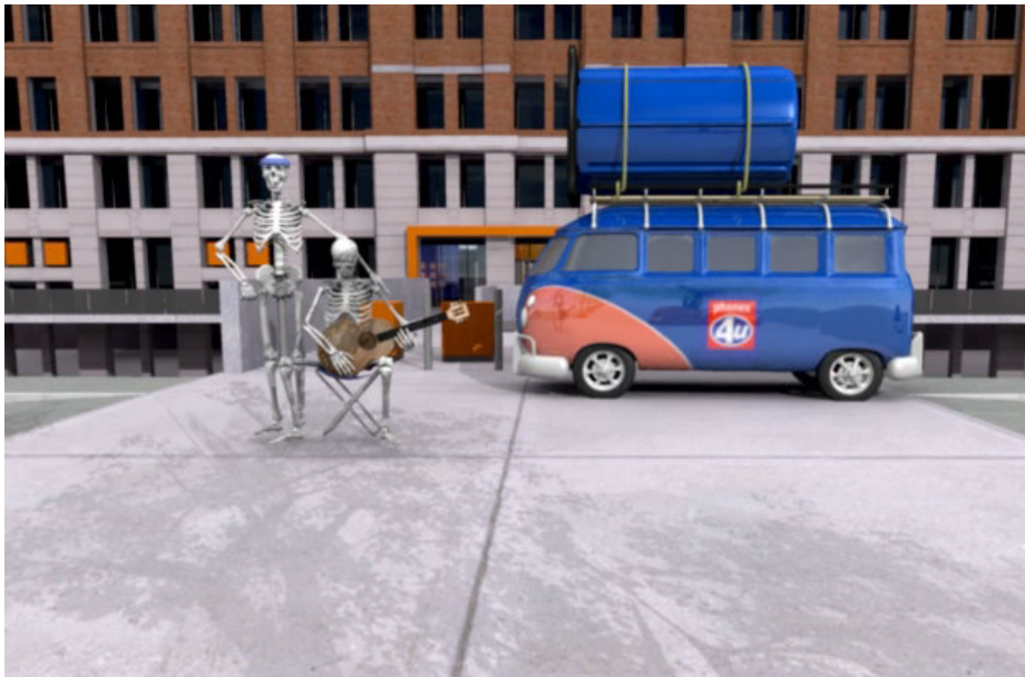
A scene from the opening movie (supplied as file: p4u_opening.jpg)